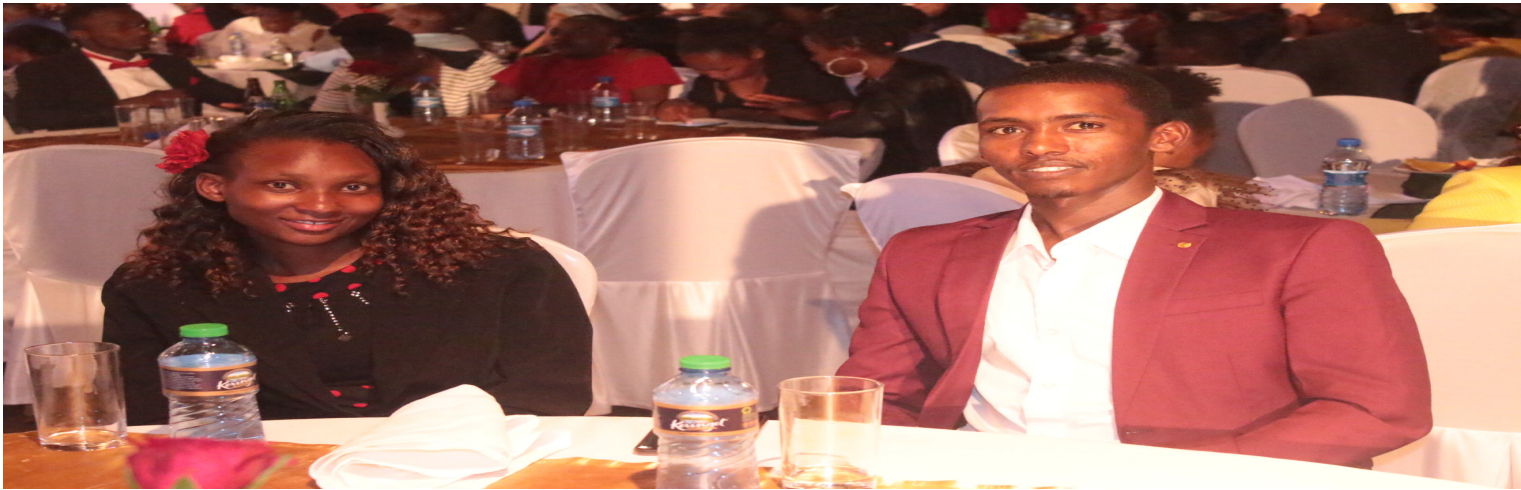
File photo: 2018 Graduands during their Graduation Dinner at Safari Park Hotel last year

On Wednesday evening, Safari Park Hotel shall play host to the University's Class of 2019 where they shall gather for the annual Graduation Dinner. Here, they shall be joined by their friends and family.