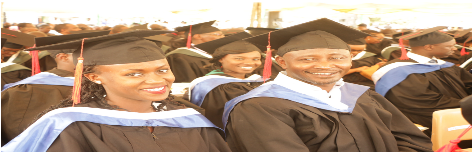
File photo: 2018 graduands all smiles at the graduation square