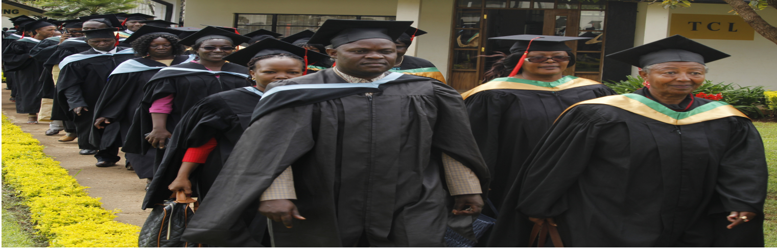
File photo: Class of 2016 proceeds to the Chapel for their Baccalaureate Service

The Class of 2019 will on Wednesday gather at Thika Road Campus where they will march to the Chapel for the Baccalaureate Service which starts from 11 am to 1 pm. During the service, the graduands will be prayed for, partake the Holy Communion, and be officially commissioned to go out and serve as Christ's ambassadors.