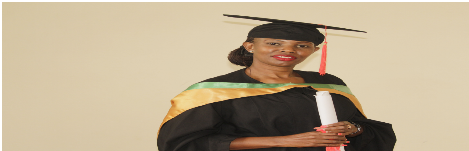
2019 graduand during the photo-shoot session for the Year Book

This Friday, the most important event in the University's academic calendar, the graduation, shall be taking place at Thika Road Campus from 8.30 am to 1 pm. The Class of 2019 shall gather at the Graduation Square where they will be conferred with various Degrees and awarded with different Diplomas.