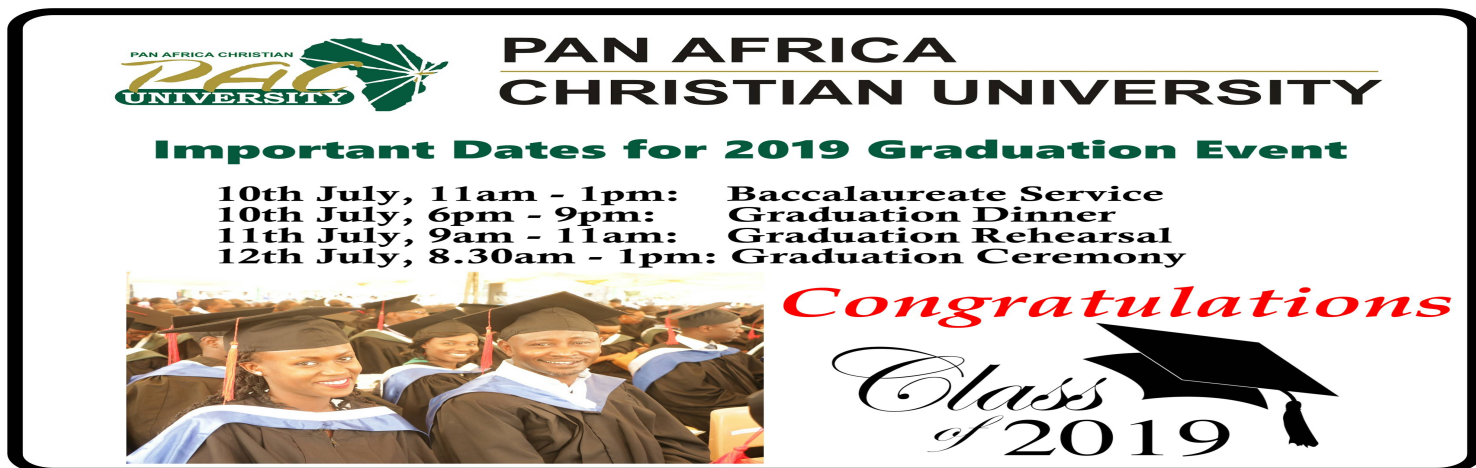
Summary of the important dates for Graduation Events