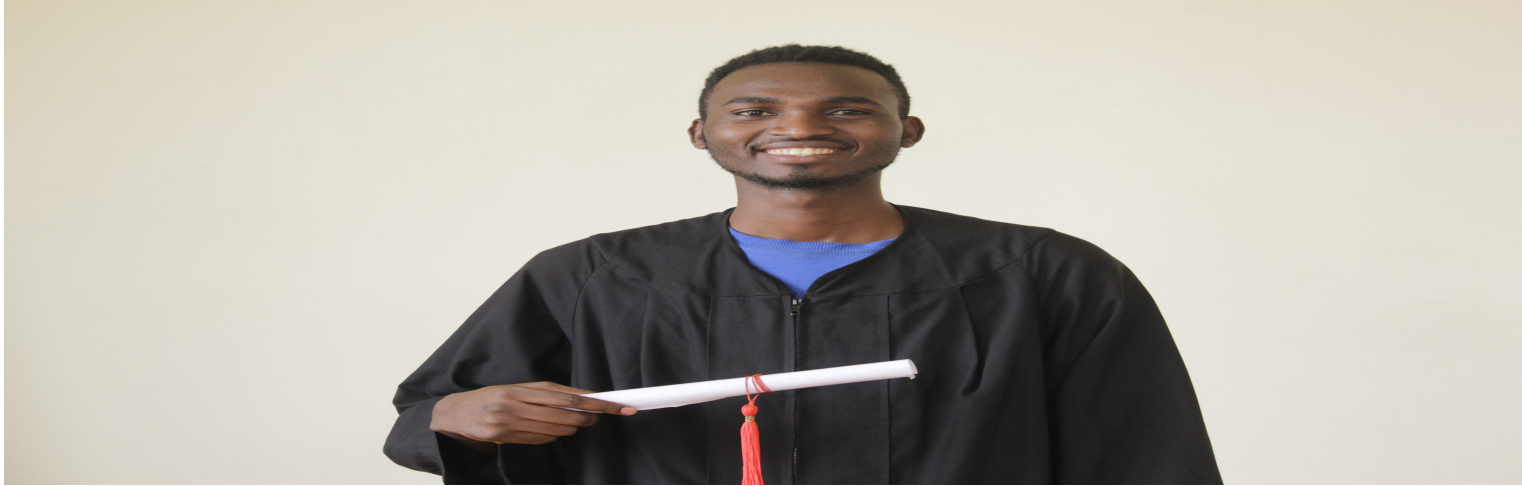
2019 graduand all smiles during a photo session

For many years, PAC University has held its graduation ceremony in the month of October, but starting this year, it will now be held in July. The Governing Council made the change primarily to give students some space in the month of October when they normally hold their annual elections. This was informed by the need to have the the two important activities (graduation and PACUSA elections) run with minimal disruptions.